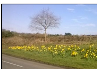
Daffodils around the parish of Bournheath, March 2016